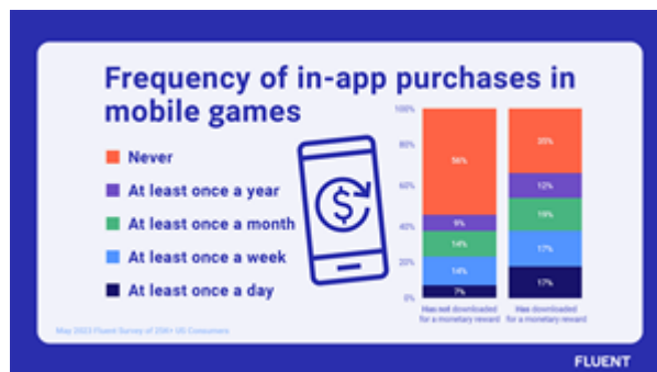
2023 Mobile Gaming Survey - Fluent, Inc.